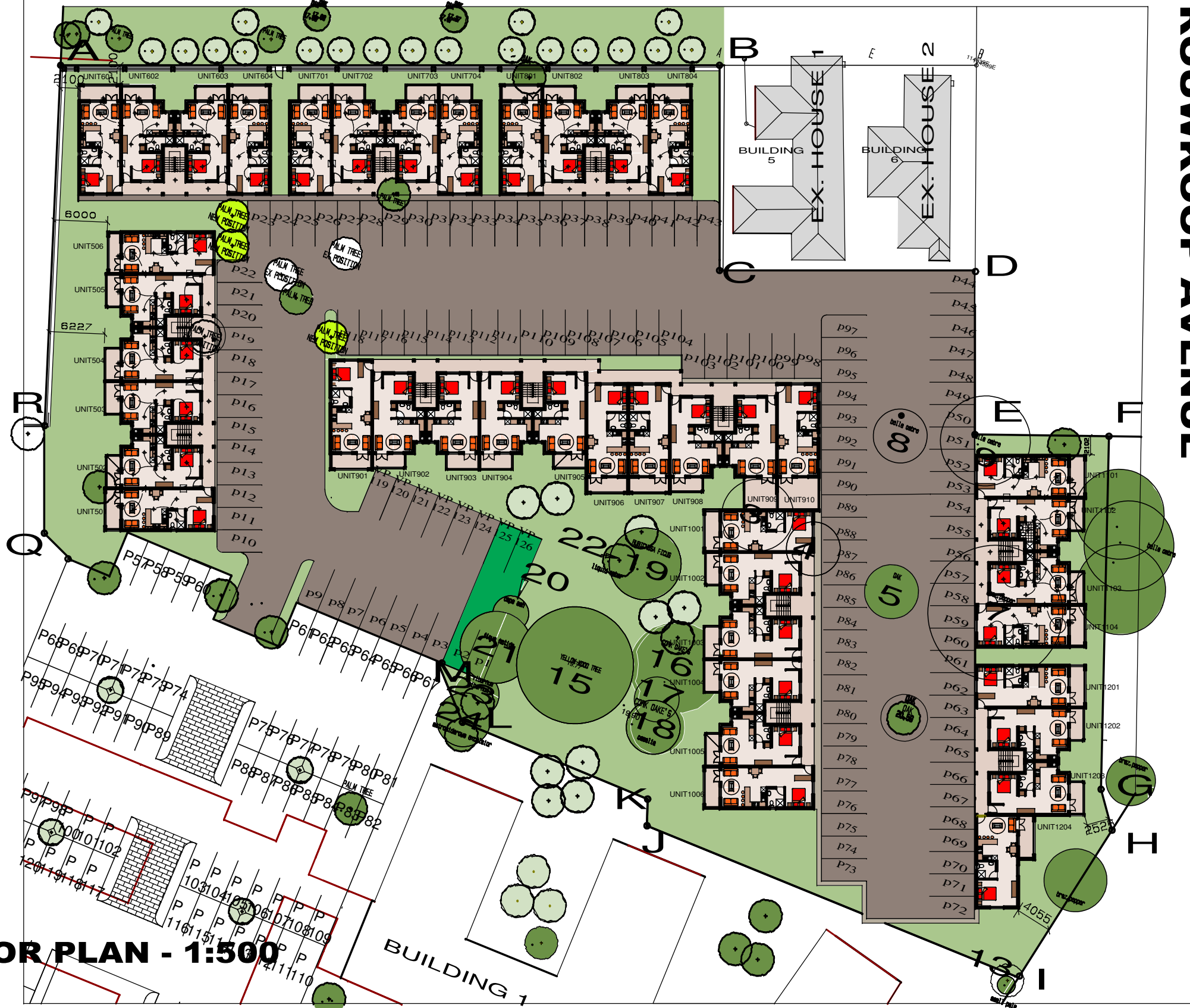
GROUND FLOOR PLAN - 1:500